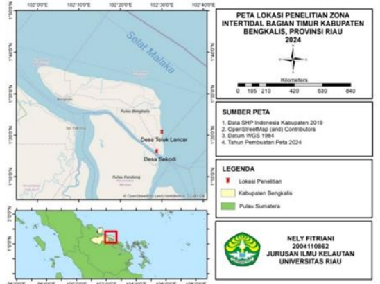
Figure 1. Map of the research location

The research was conducted from December 2023 to January 2024. The sampling location was in the intertidal zone of the eastern coast of Bengkalis Island, Riau Province (Figure 1).